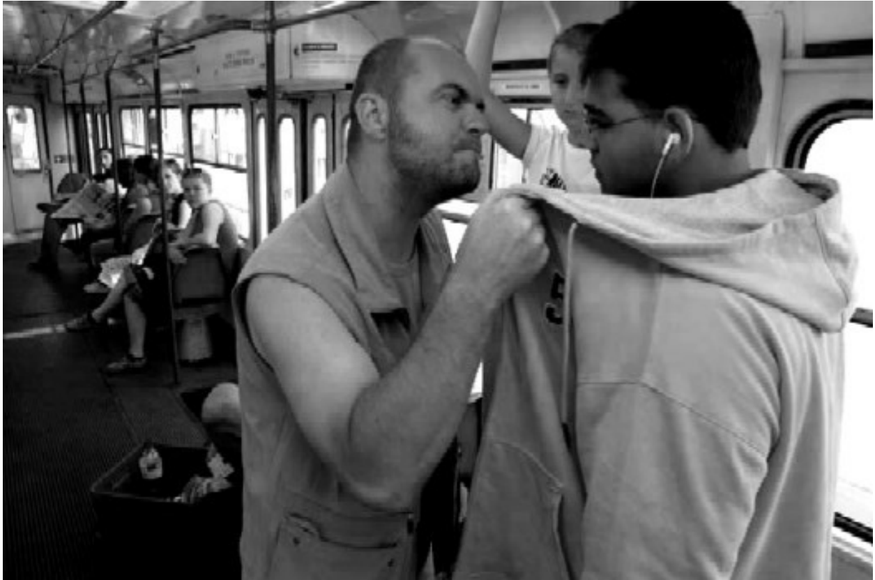
Filming the “Be Aware of Your Prejudices” TV Public Service Announcement in the Czech Republic. The spot was aired more than 60 times on two national Czech TV stations. A modified version was viewed by over 75,000 cinemagoers.