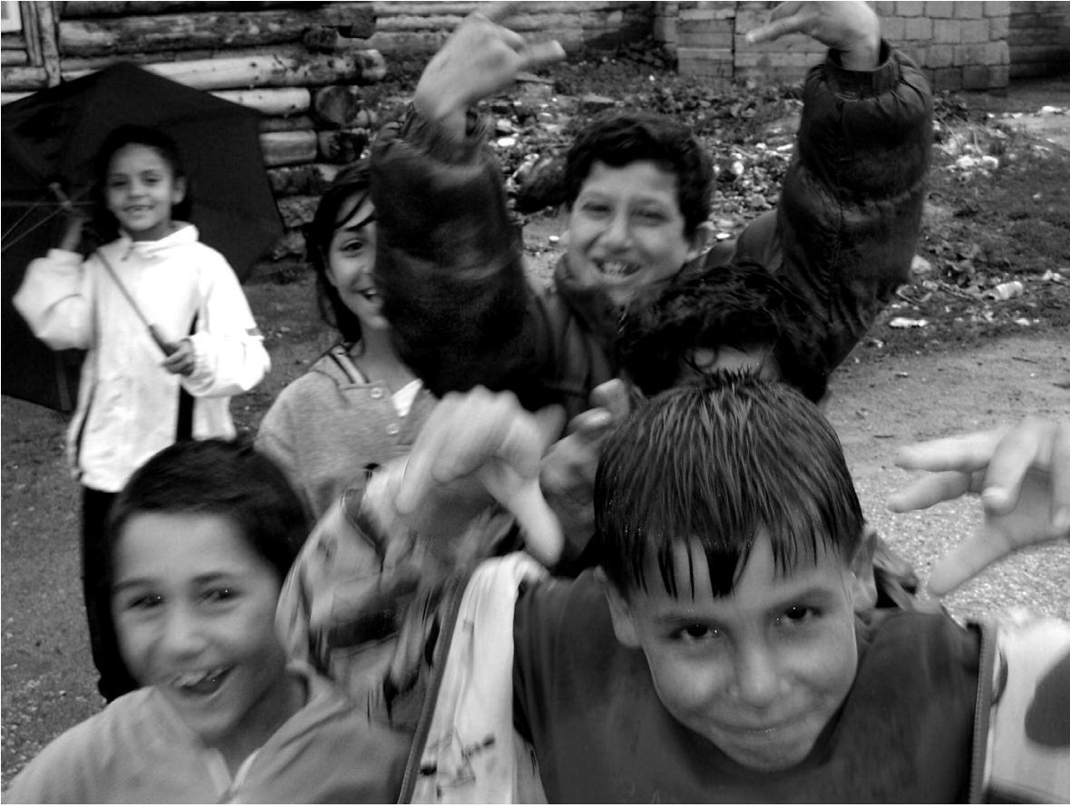
Roma children in Poprad, Slovakia.